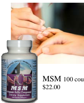
MSM 100 count $22.00

needed amount of MSM, it attaches but becomes rigid. When tissues lose their flexibility, problems develop with the lungs and other parts of the body. The sulfur-containing structural protein that is found throughout the body is in the epidermis of the hair follicles, in the bronchial epithelium of the lungs, in intestinal mucosa and is extremely abundant in the nails. In fact, fingernails have more sulfur than any other part of the body.